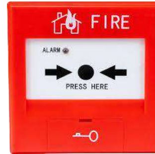
MCP PUSH BUTTON TYPE