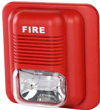
HOOTER CUM FLASHER