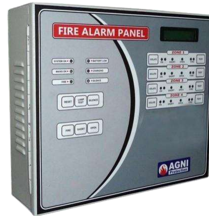
FIRE ALARM PANEL