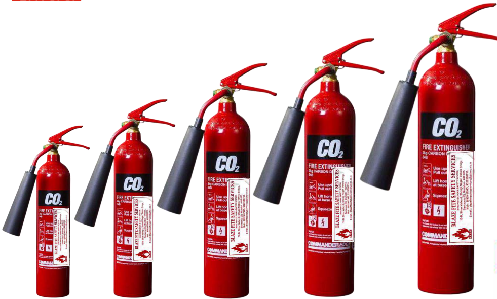
2kg 4.5kg 6.5kg 9kg 22.5kg

Carbon Dioxide Fire Extinguishers are ideal for use on Class B fire risks. The Blaze Fite Safety Service Extinguishers are available in 2kg, 4.5kg, 6.5kg, 9kg & 22.5kg Standard version.